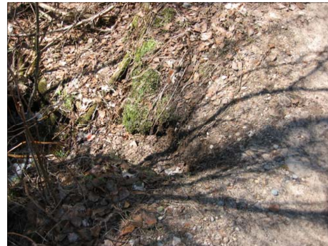
Eroded shoulder. Stream flow has eroded the soil away from the culvert inlet undermining the trail bed.